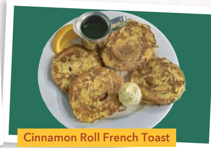
Cinnamon Roll French Toast