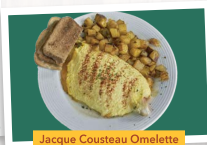
Jacque Cousteau Omelette