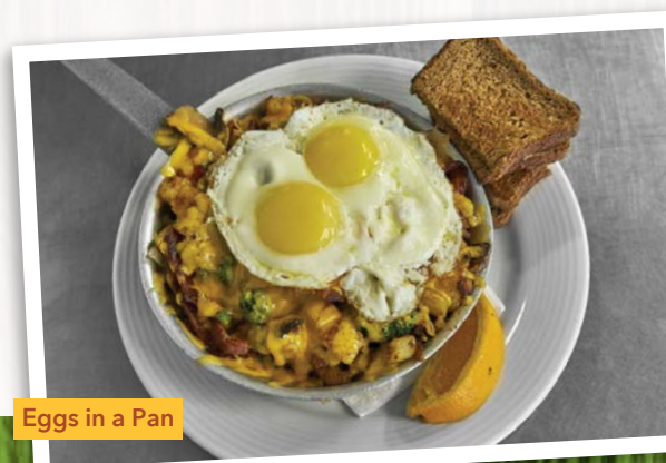
Eggs in a Pan