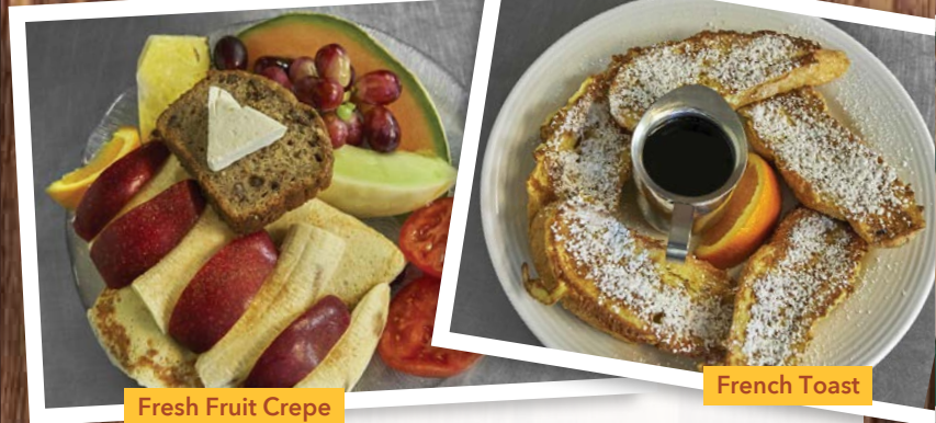
Fresh Fruit Crepe

Market fresh vegetables, cheddar cheese, potatoes, with mixed toast and eggs. Served with your choice of bacon, ham, sausage or turkey 15.00