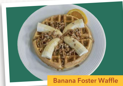
Banana Foster Waffle